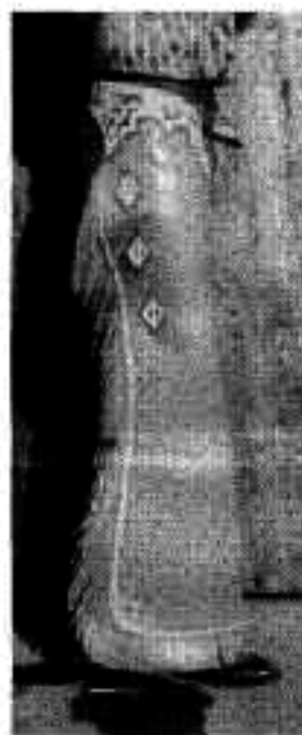
STYLE - K