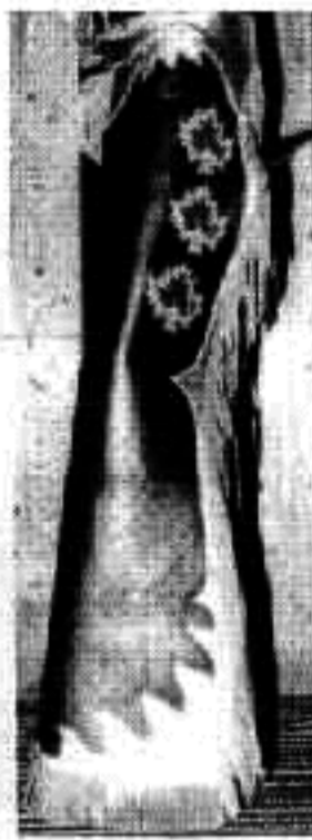
STYLE - F