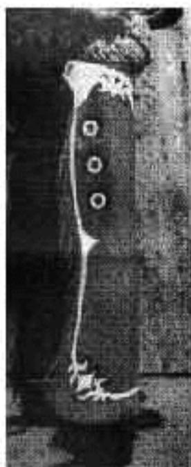
STYLE - J