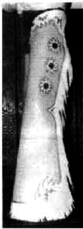
STYLE - A