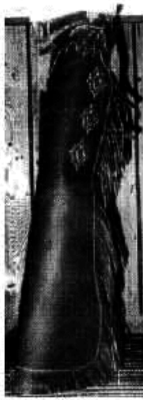
STYLE - B