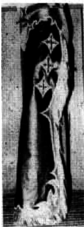
STYLE - E