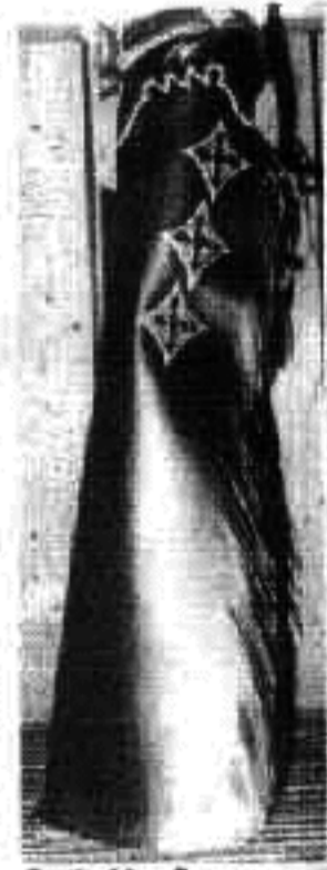
STYLE - H