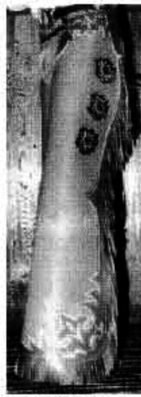
STYLE - D