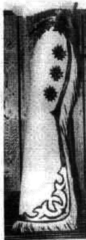
STYLE - G