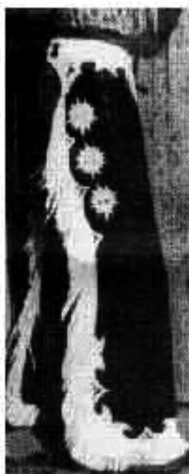
STYLE - I